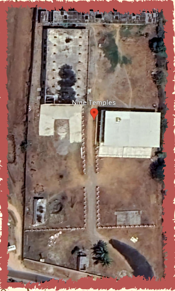
Aerial View of 9 Temples

The merit of donating land for temple construction endures and benefits the donor across many lifetimes. (Garuda Puran)