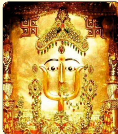
Rani Sati Dadi