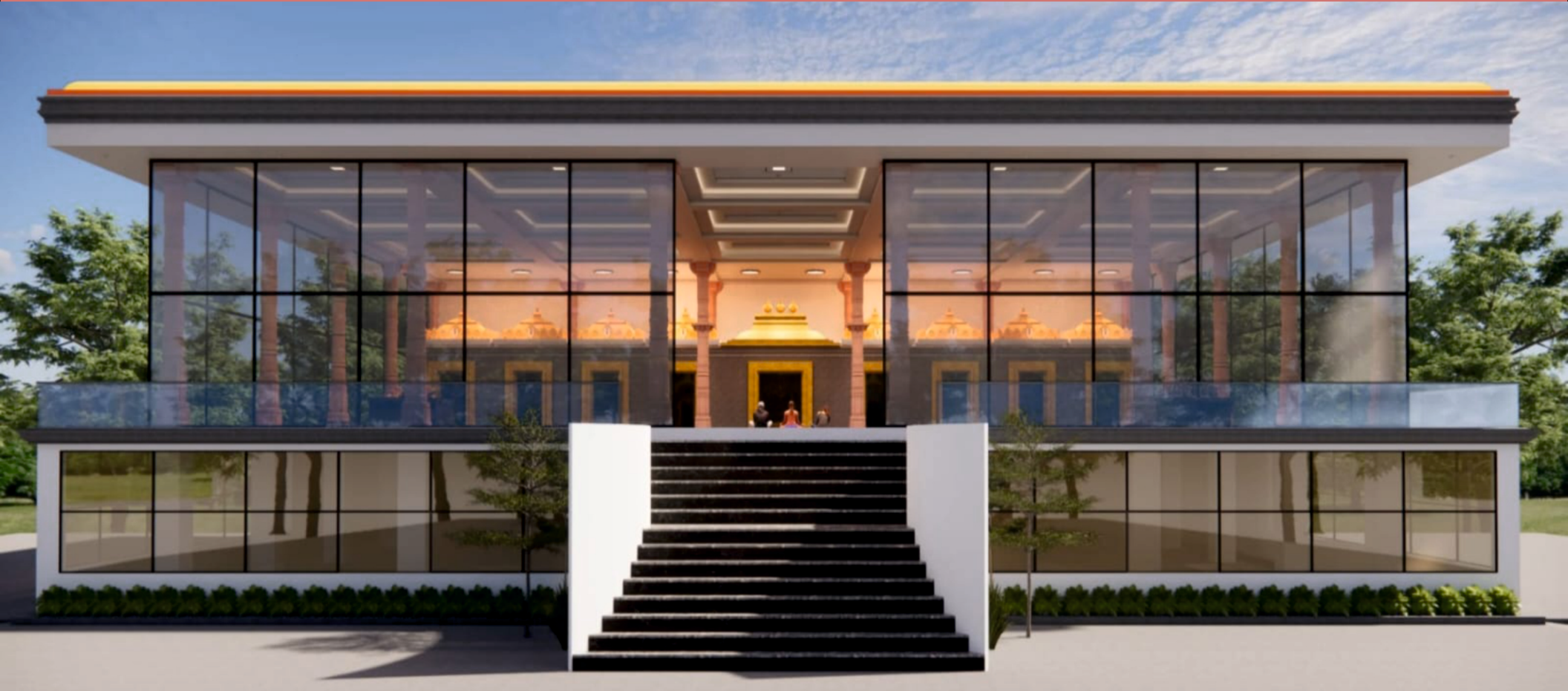
PROPOSED DESIGN OF NEW 9 TEMPLE