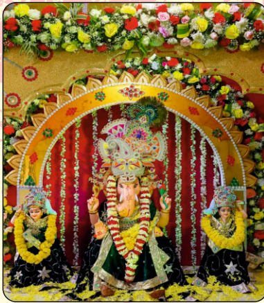
Ridhi Sidhi Ganesh